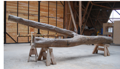
Figure 4 A tree fork before been machined.

The Digital Urban Orchard research project (DUO) involves the construction of a functional prototype to be implemented in urban public spaces within the self-sufficiency programme of the city of Barcelona. The OTF pavilion stems from the relation among form, function and application context for a new concept of socialization space and food production (Figure 5). As subsidiary section of the study, the built prototype hosts a hydroponic farming system and a opening silicone skin able to ensure the indoor comfort conditions for plants by natural ventilation. The simultaneous concerns on designing a stable yet iterative structure and on the solar gain have required