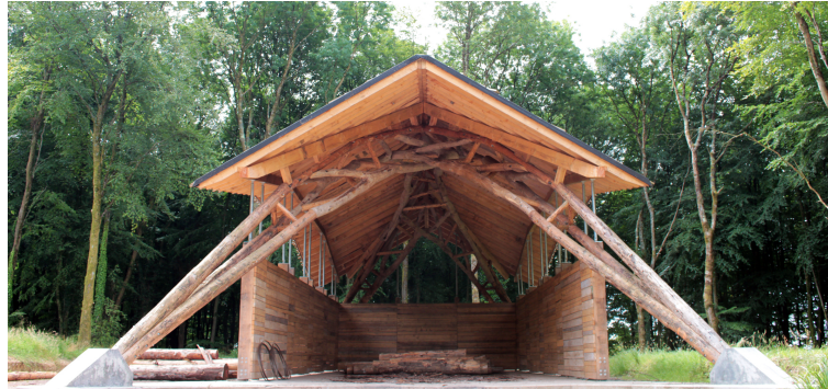
Figure 3 Overall view of the Wood Chip Barn with perimeter walls and roof on top of the truss.

in robotic fabrication as strength of the applied research. The Woodchip Barn project is entirely built with non-engineered wood and thoroughly relies on a data-driven process coming from the survey of the tree forks' digital catalogue.