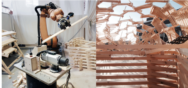
Figure 6 Left: robotic fabrication process. Right: DUO's inner view.

working setup opens up the debate around the fabrication's tolerance: the integration between technical/technological systems and low-engineered setup produces variances between the virtual design and the material actual size pavilion, due to high tolerance.