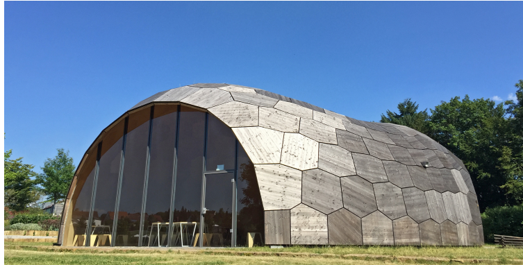
Figure 1 Overall view of the Landesgartenschau Exhibition Hall.

compassed, the focus of the research shifts from the computable abstraction to the tangible computing of its manufacturing process. The same transdisciplinary key concepts - such as automation, adaptation, emergence, convergence, communication, efficiency, efficacy, and connectivity -, that have been the foundational thoughts for the transfer of cybernetics' logics within the architectural designing flow, are now becoming paradigms addressed towards fabrication. Thus, the project conceptualized as a computational system transfers its rule-based design in criteria involving both digital machineries and materials. The spread of digital fabrication facilities in architecture activates the "new digital continuum" (Kolarevic, 2003) inasmuch capabilities like standardization or automation don't represent simply practical solutions, but they become design parameters in assuring architectural qualities.