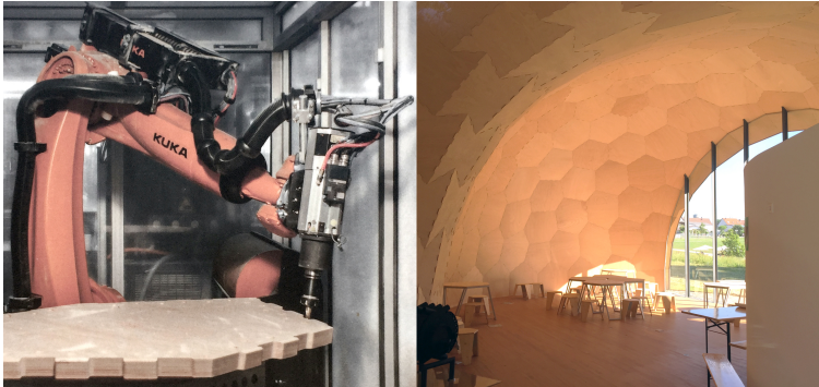
Figure 2 Left: robot milling from the public information panels. Right: internal view of the plate outlines that visually reflect the changing of Gaussian curvature.

As a prime example, the Landesgartenschau Exhibition Hall (LaGa from here on) largely demonstrates the efficiency of the “machinic morphospace” (Menges, 2012) first applied at a building size. The applied morphogenetic process explores the multifarious advantages arising from the reciprocal influence between the rationalization of biological rules, the material fabrication requirements and from the multiple performative applications. The entire constructive principle of this exhibition hall is based on the large-scale application of the robotically fabricated finger joint system, developed in the previous biomimetic research of the Research Pavilion 2011 by ICD and ITKE.