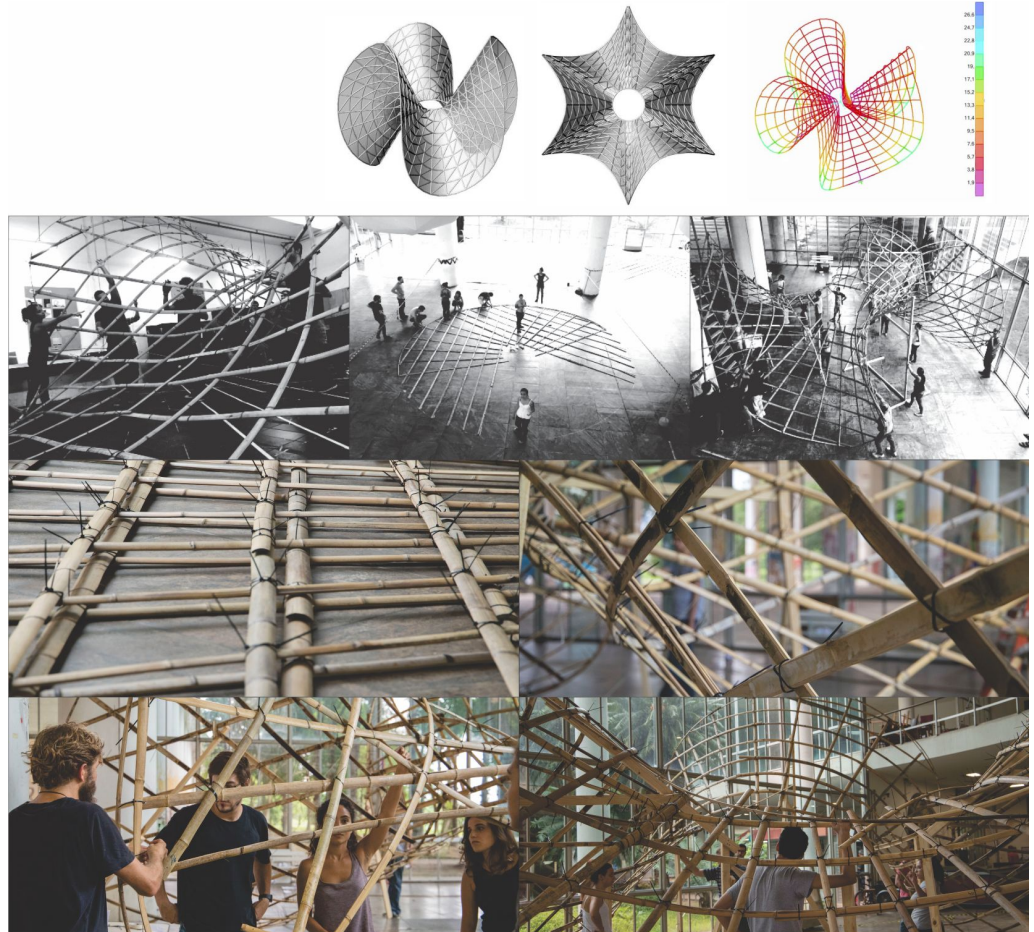
Figure 1 Tropical Gridshell Experience, workshop at Rio de Janeiro Federal University, March 2018. Trefoil Pavilion, a parabolic hyperboloid gridshell, constructed in bamboo.

ceive a formal education. Therefore, we had to start our own research regarding bamboo properties, processes and suppliers. We looked for a local architect experienced in traditional building using bamboo and an advanced engineer that could use structural programming.